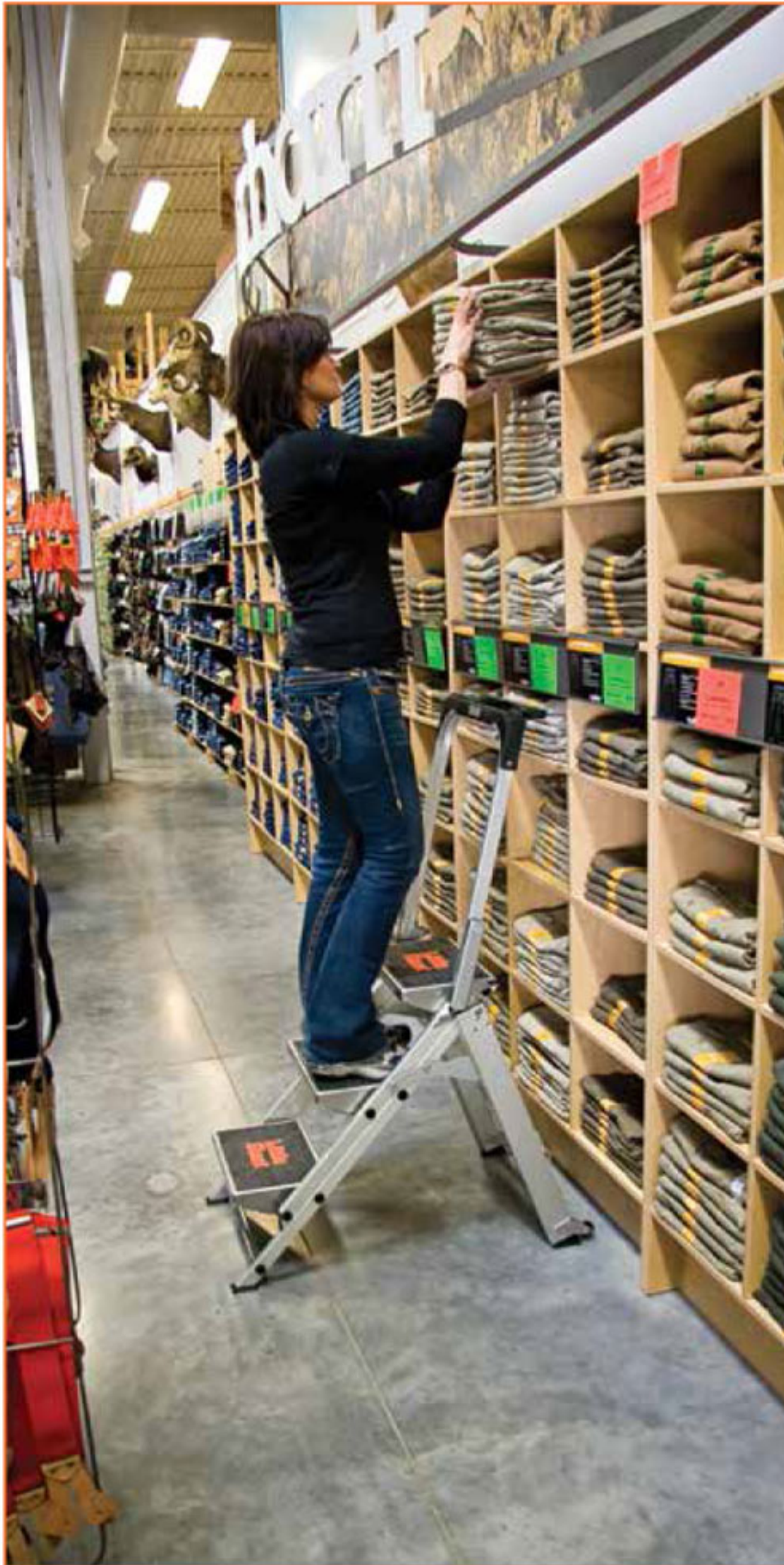
Safe, sturdy, portable staircase.